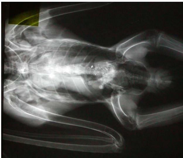
x-ray of deer carcass shot with two lead slugs showing lead fragments >>

After gathering as much data as possible on this phenomenon, evidence points to lead fragments in deer carcasses shot with lead slugs as a source of the ingested lead.