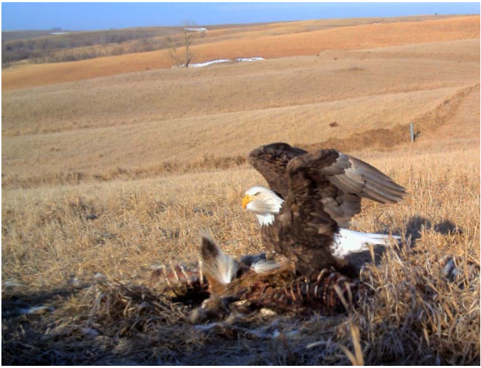
<< bald eagle photographed with a trail cam feeding from a deer carcass

Clinical trials have documented that a very small amount of lead ingested by an eagle is lethal. Less than 200 mg of lead (a piece smaller than one piece of #4 shot) can cause death (Pattee et al 1981). It is not known, at this point, what effect lead poisoning and exposure could have on bald eagle populations. Certainly, not all injured or dead eagles are found and brought to rehabilitation facilities. Twenty two eagles have died from lead poisoning or exposure thus far in 2009.