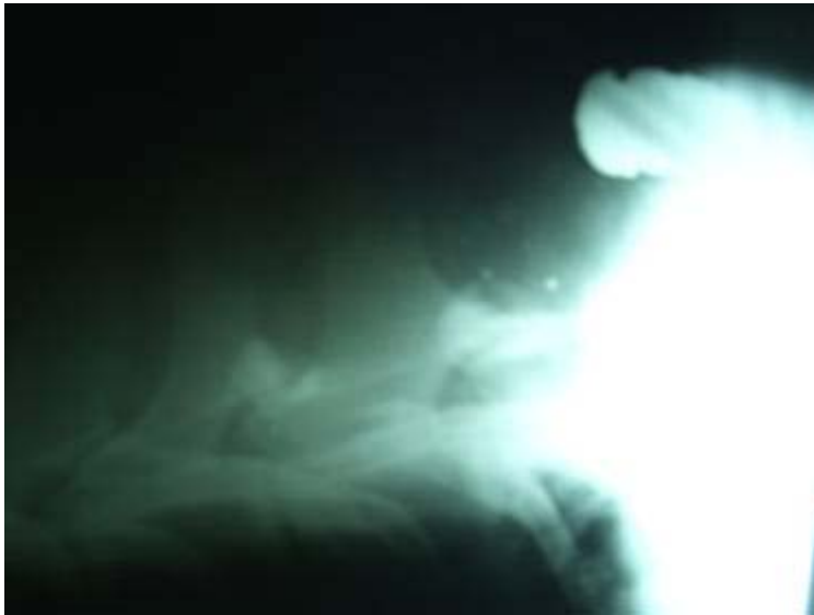
This x-ray shows most of lead slug remaining in a field dressed deer. The slug is lodged just above the spine, between the shoulder blades. There are also lead fragments in the back strap meat.

None of the copper slug shot deer contained visible fragments of copper. One retained the entire copper slug intact in the flank. One gut pile contained an entire copper slug.