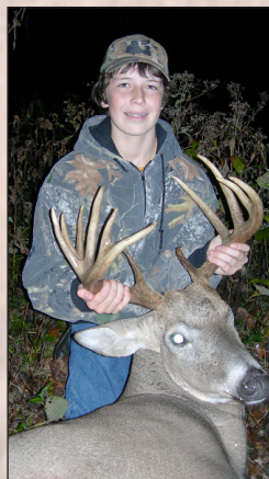
"Deer hunters that use copper bullets and slugs report excellent results."

If you can't find non-lead ammunition at your local store, ask them to stock some. Increased demand brings down prices. Watch for sales during the off-season.